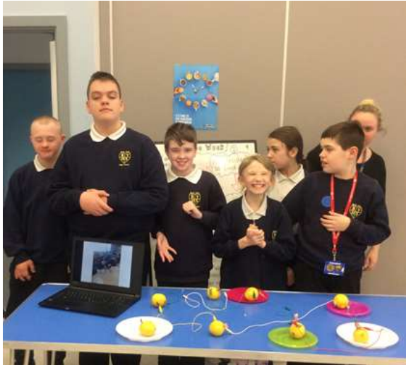
Our Winners: Base 2

Thank you again to all who got involved and helped make this event so successful.